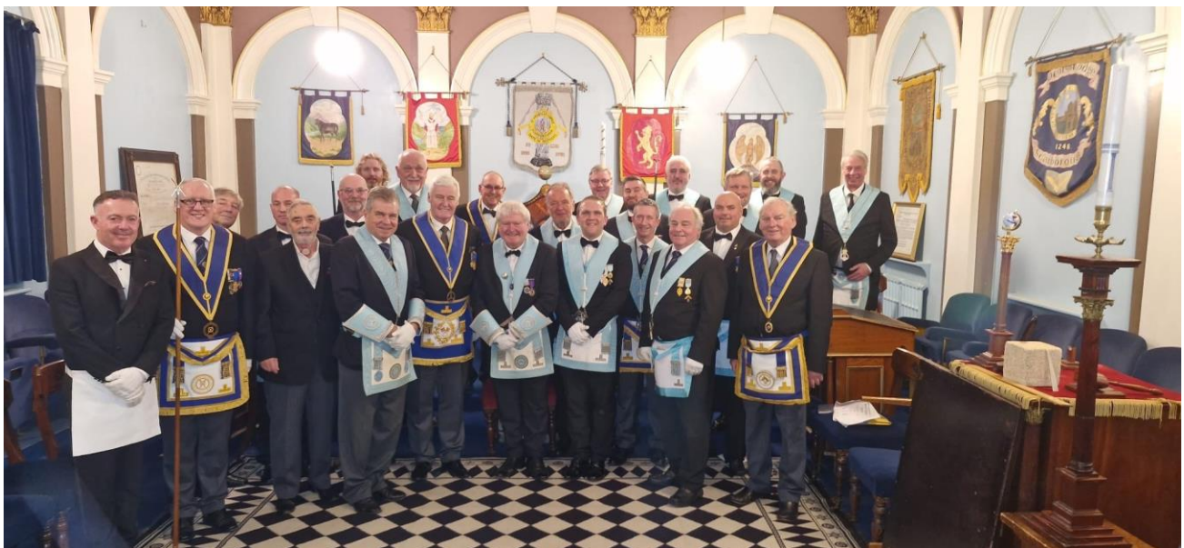
The team of 2026

All in all, we are looking forward to an exciting 2026!