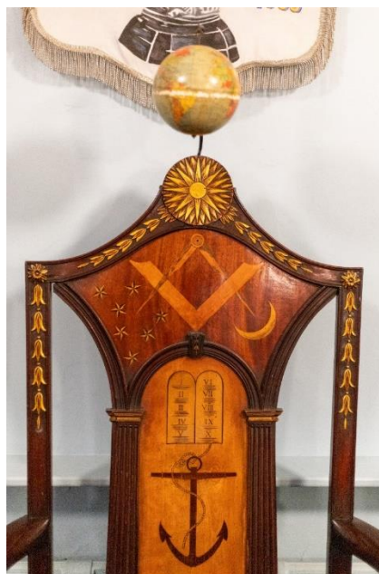
The Worshipful Masters Chair in Scarborough Masonic Hall

In summary, King Solomon's Chair in Freemasonry is a powerful emblem of leadership, wisdom, and responsibility. It reminds the Master that he symbolically occupies Solomon's place — guiding the Craft with fairness, integrity, and dedication to the principles of Brotherly Love, Relief, and Truth.