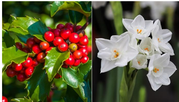
Holly and Narcissus – birth flowers of December