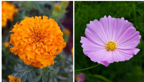
The Marigold and Cosmos – birth flowers of October