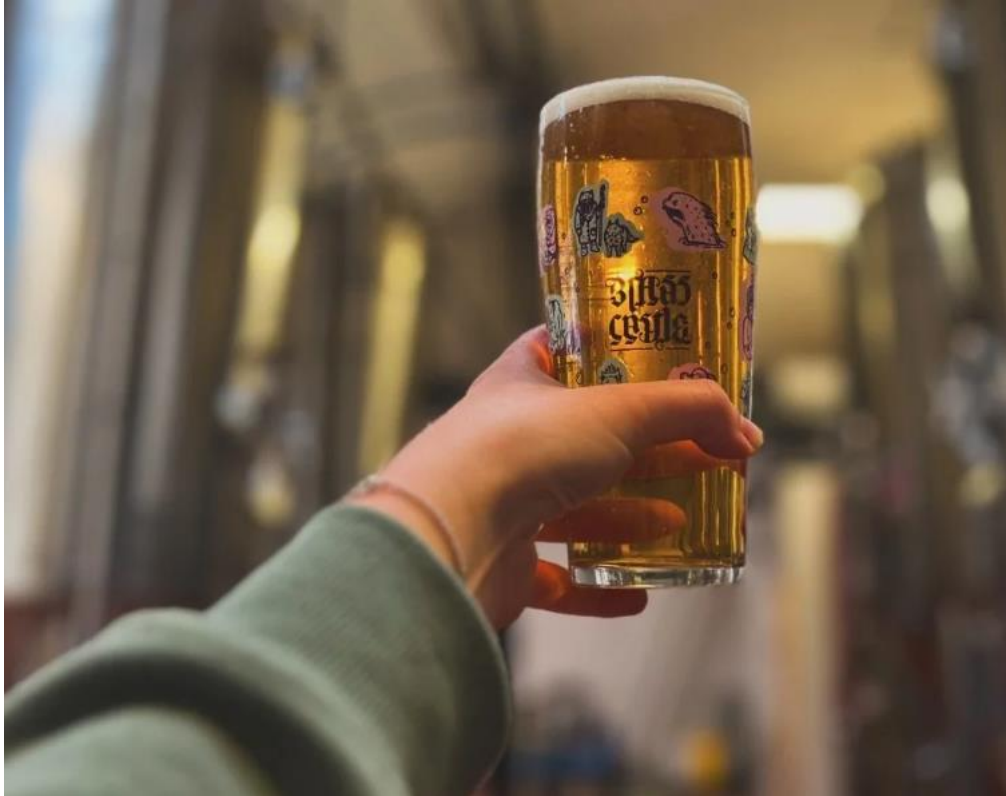
Brass Castle Brewery - Malton